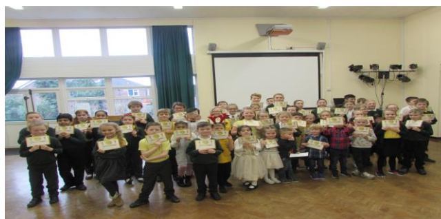
100% attendance winners